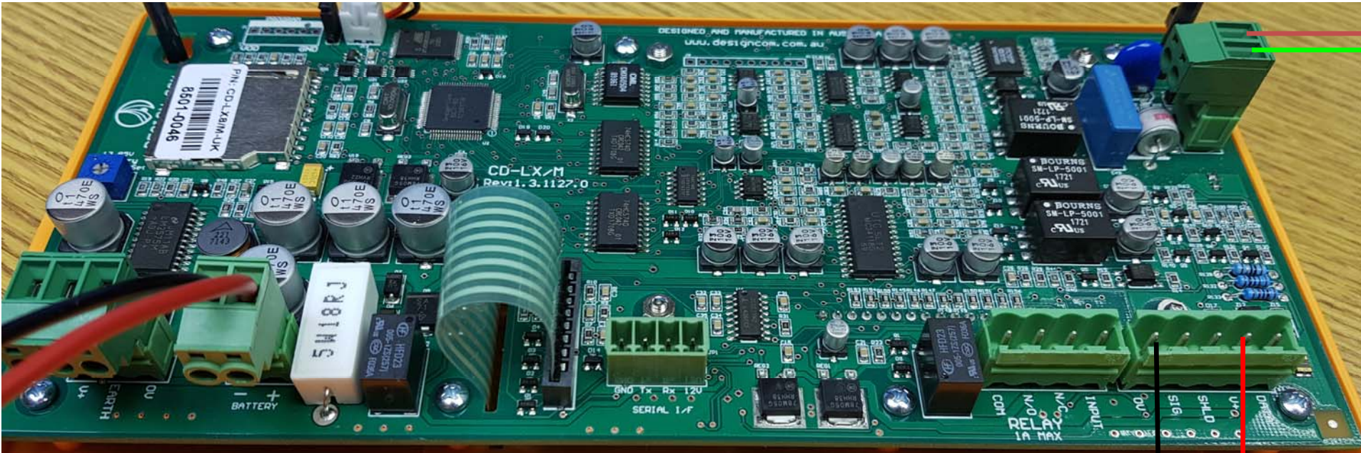
LX8 EmFONE Motherboard